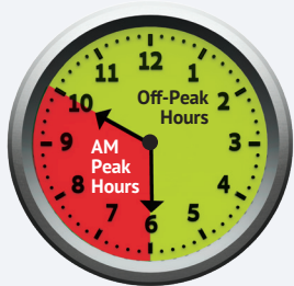
6-10 AM Weekdays